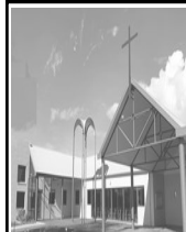
St. John the Baptist

St John the Baptist Church 62 Bowden Street, Glenorchy, 7010